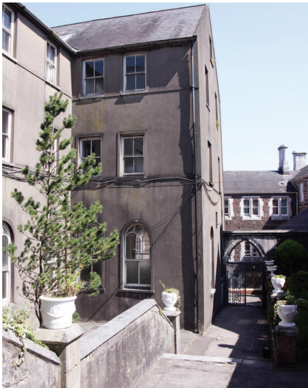
7 – Steps leading from the convent building down to Douglas Street The characteristic changes of level and profusion of steps result from the steeply inclined site.

opposite 6 – Exterior of the South Presentation Convent showing the front (north) elevation of the original convent building built by Nano Nagle for the Ursuline Sisters The main entrance door can be seen at the top of the steps on the right. The extensions to both sides were added later by the Ursulines to accommodate expanding numbers.