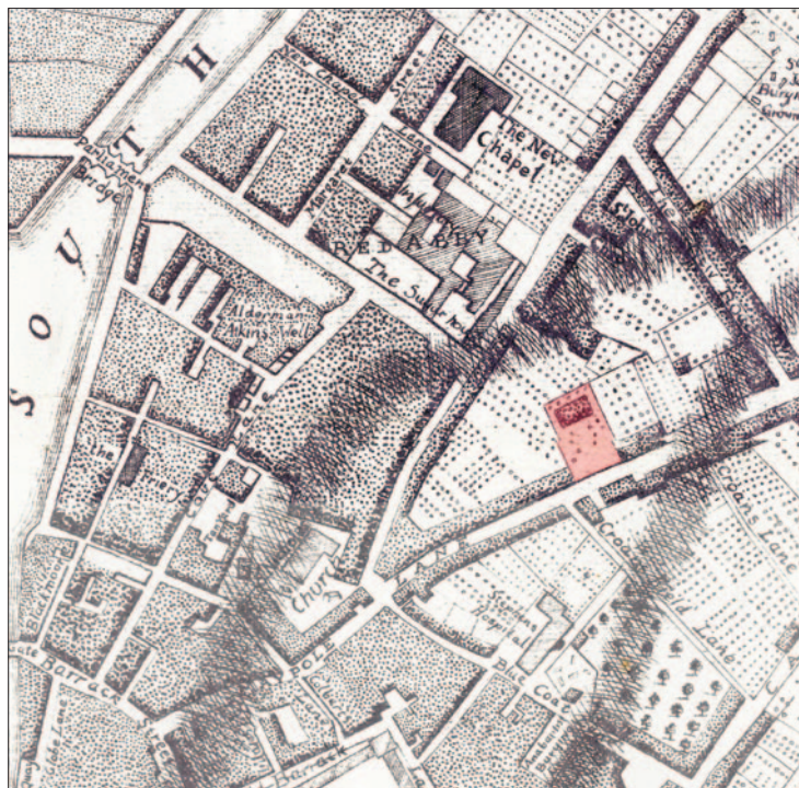
5 – John Rocque, MAP OF CORK CITY, 1773 , detail showing the first building on the South Presentation Convent site

Bringing the Ursulines to Cork was an expensive venture. Nagle estimated that she spent between £4,000 and £5,000 on the Ursuline foundation. 28 Having invested so much of her own personal fortune in the project, she closely followed the progress of the building and did not shy away from visiting the site while the construction works were underway. In September 1770 she wrote to Eleanor Fitzsimons, one of the women training at the