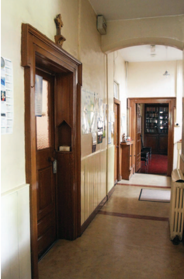
8 – First floor of the original convent building showing lugged architraves to the eighteenth-century raised and fielded panel doors