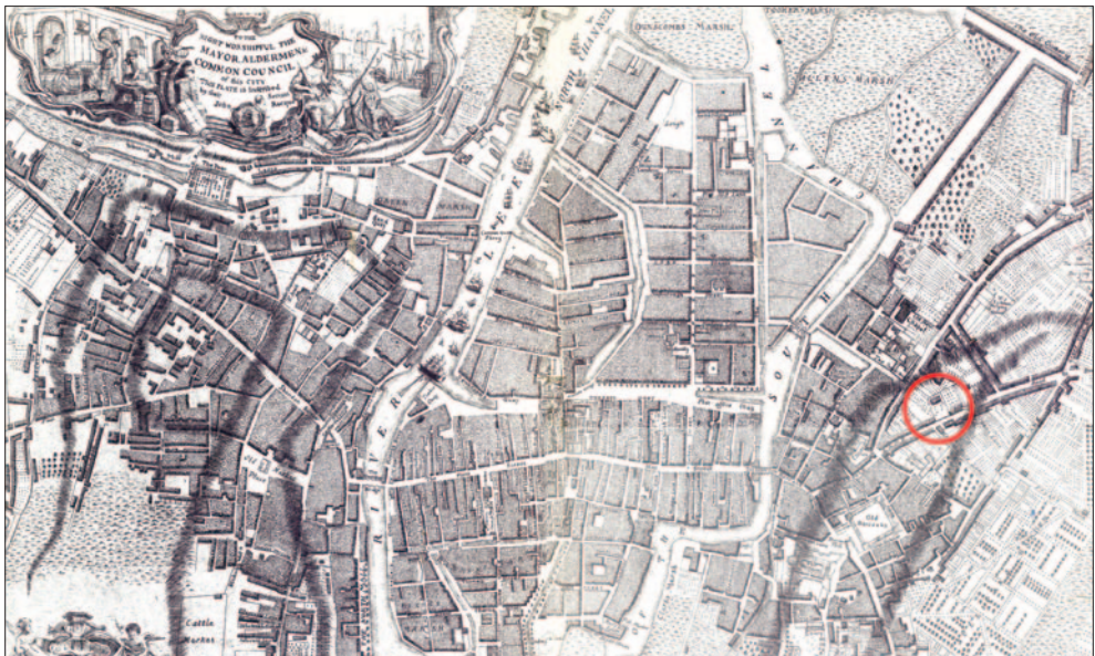
3 – John Rocque, detail of MAP OF CORK CITY, 1773 with location of Nano Nagle's first convent indicated