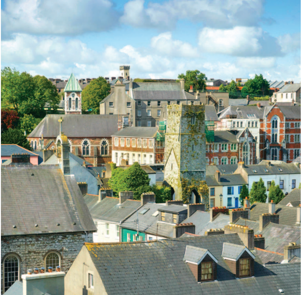
4 – Present-day view of the South Presentation Convent, from the north, with its associated sandstone chapel and former alms house, and red-brick school building. The tower of the former Augustinian Friary and the eighteenth-century South Chapel can be seen in the foreground.